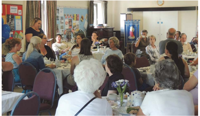
Launch of Waterbeach Mothers' Union in July

In Waterbeach: We currently meet once a month and have local, national and international items on our agenda. We have started working to support our local hostel and will be continuing to do so over the coming year. Some future discussions will include the 'Bye Buy Childhood' campaign ( www.byebuychildhood.org ) and 'Faith in the Family'.